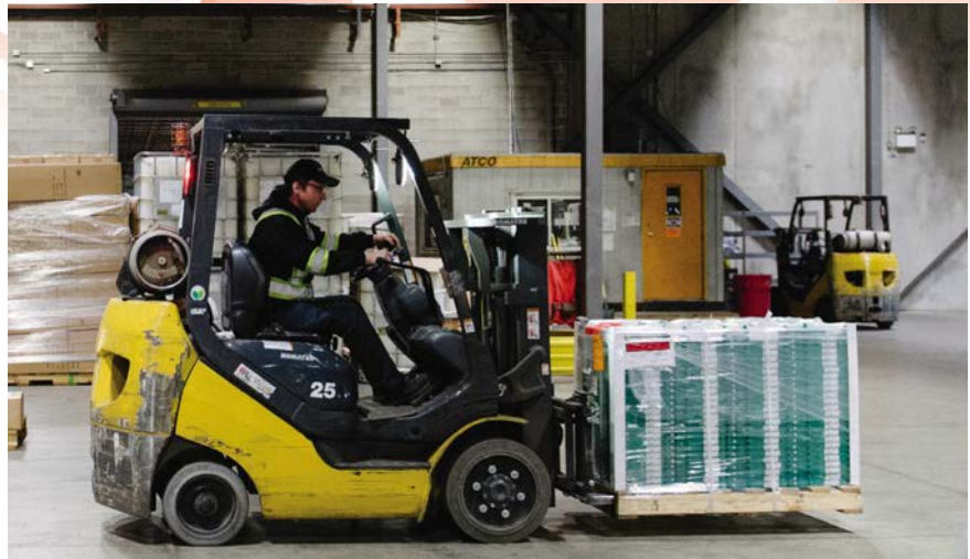
Polaris Transportation Group is one of the largest privately held Canadian LTL carriers with four operating divisions: Polaris Transport Carriers, Polaris Global Logistics, Polaris Commercial Warehousing, and NorthStar Digital Solutions.

our clients today, including discussions about where business is going,” he says. “In addition, we find more clients are pre-booking space. That didn’t happen so much before.”