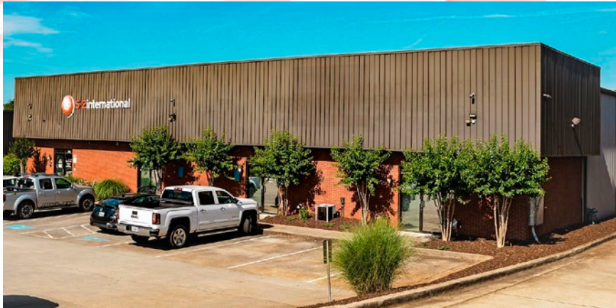
A provider of premium transportation solutions, S-2international LLC offers comprehensive services—including cross-border Canada—to a wide variety of industries with ground expediting as well as service-sensitive LTL and truckload.

shore in the United States, Canada, and Mexico, resulting in even tighter bonds in the “North American supply chain.”