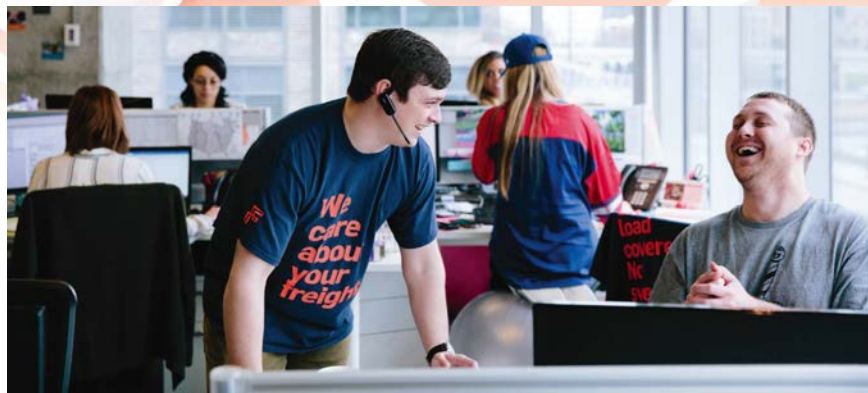
With 18 offices throughout North America, FLS is a cross-border 3PL specialist. In addition to its core competency in over-the-road transport, FLS provides customizable contract logistics functions, including warehousing, cross dock, project logistics, and freight management.

and the United States more reliant on each other.”