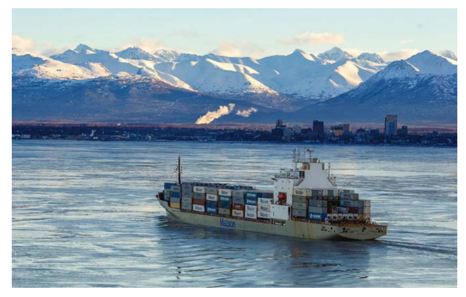
In addition to shipments from the lower 48 to south central Alaska, Span Alaska-a subsidiary of Matson Logistics-offers overnight service from Anchorage to Fairbanks and the Kenai Peninsula, and provides LTL service via barge from Seattle to Southeast Alaska.

The transportation department's central region expects a busy construction year through 2021, awarding up to $420 million in construction contracts, including airport, trail, and highway improvements.