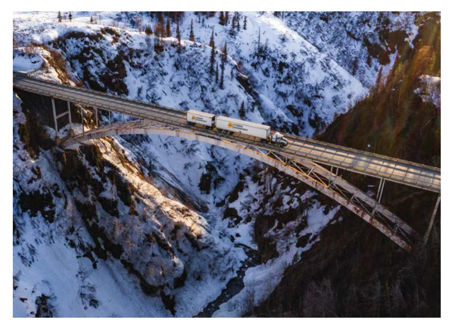
The Lynden family of companies provides transportation and logistics solutions in Alaska, Canada, the Pacific Northwest, Hawaii, and around the world.