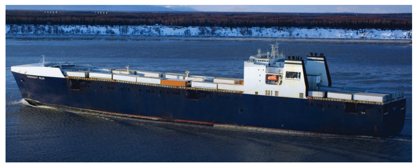
Handling a wide variety of time-sensitive customer cargo in retail, medical, and dry/temperature-controlled foods and products, Odyssey's services are available in all modes of transport.

Beyond regular health and safety protocols, TOTE implemented special provisions to minimize the ship-toshore interface in order to mitigate the risk of exposure to the coronavirus on vessels. The company also updated policies regarding crew changes through stricter pre-boarding quarantines and testing requirements.