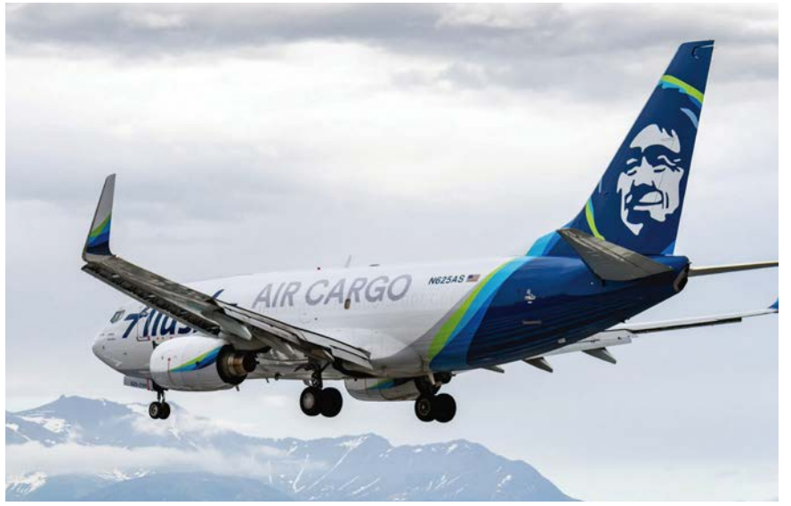
Alaska Airlines transports e-commerce goods and other critical supplies such as medicine, medical supplies, and perishables into and around the state. Its Alaska Air Cargo network includes more than 100 destinations in the United States, Canada, and Mexico.

shipments, and complete necessary paperwork such as bills of lading.