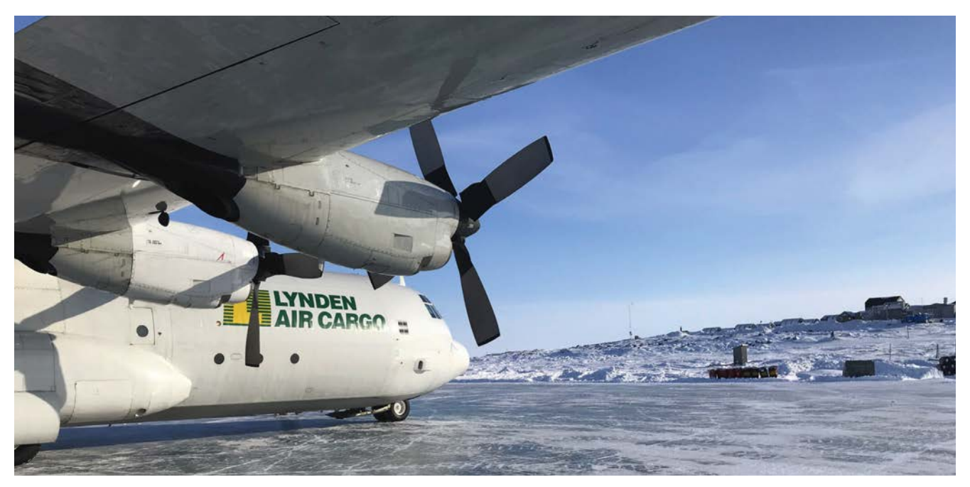
Covering even the most remote areas of Alaska, Lynden counts on its fleet of Hercules cargo planes—basically flying trucks—and an arsenal that includes commercial-size hovercraft, which can carry up to 12,500 pounds of freight.

The Western Union line linked underwater with an Asian line. Even then it was clear that navigating Alaska was all about logistics—the art and science of connectivity.